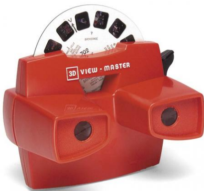
Fig 2: A View-Master

you have been able to buy booklets of pictures, to be viewed through red and green glasses, resulting in a realistic 3D image, in a horrible mixture of red, green and brown! In 1939, an updated version of the stereoscope appeared as the 'View-Master', which used a disc with seven pairs of coloured stereoscopic photographs (Fig 2). Depressing the lever advanced to the next image. Movies in 3D were produced from the 1940's onwards, initially using the red/green (anaglyph) system, but much more successfully in full colour, using Polaroid (see below). Such movies never really 'caught on', partly because of the need to wear special glasses, and partly because 3D is really a slightly pointless 'gimmick'! There has recently been an explosion of 3D movies, of which 'Avatar' is the best known, but I suspect this craze will die out, and for the same reasons. Extremely expensive 3D televisions are now on sale, but it would be surprising if they ever become popular.